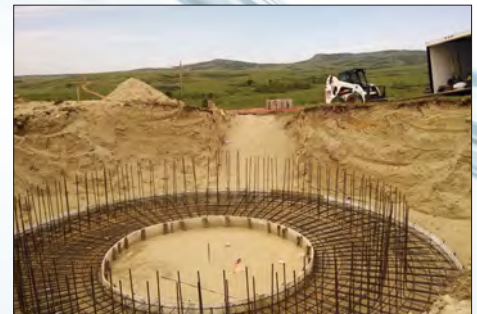
Killdeer Mountain Elevated Tank

The contractor of the Killdeer Mountain Elevated Tank has completed foundation work and has begun pedestal work.