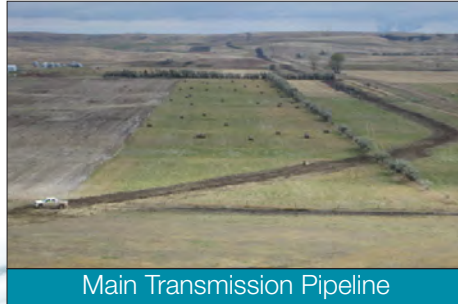
Main Transmission Pipeline

begin this year and when complete this service area will add an additional 270 miles of pipeline and connect 255 users. Please be patient during construction, as there are over 500 miles of pipeline which takes time and cooperating weather to complete.