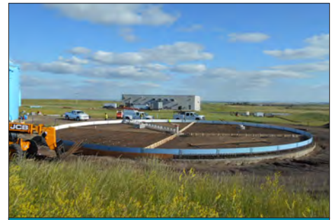
Fourth Tank at OMND WTP

work is complete. This is the fourth tank at the OMND WTP site.