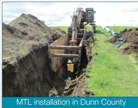
MTL installation in Dunn County

Construction on the Main Transmission Line (MTL) resumed in early June for the first phase of the line. When complete it will reach west of the OMND WTP to north of Halliday. The second phase of the MTL began in July and will reach to northwest of Killdeer. Tanks, treatment and MTLs are the foundation to bring water service to residents.